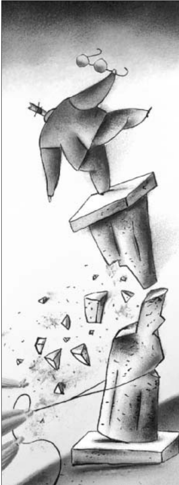
While celebrating a win is fine, declaring the war won can be catastrophic.

When it becomes clear to people that major change will take a long time, urgency levels can drop. Commitments to produce short-term wins help keep the urgency level up and force detailed analytical thinking that can clarify or revise visions.